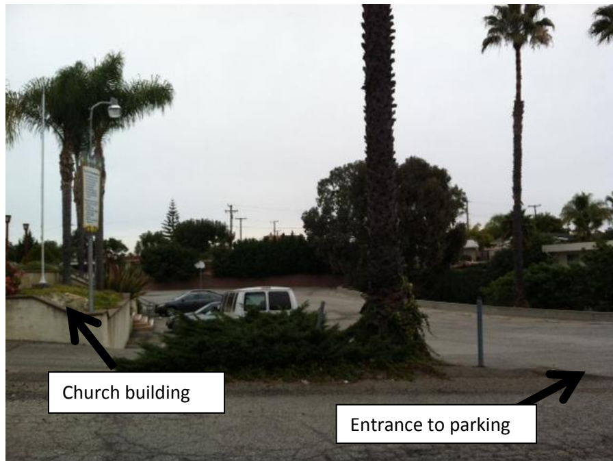
Summerland Street: The road adjacent to the church parking lot.